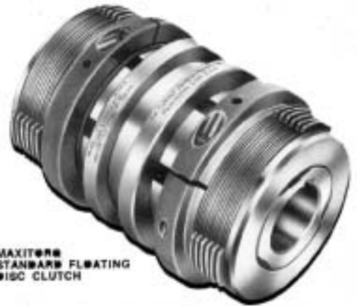
MAXITORQ STANDARD FLOATING DISC CLUTCH

Maxitorq Multiple Disc Clutches have been factory adjusted and should not require attention for some time if properly operated and kept reasonably clean and free of grease. When adjustments are needed, however, the following information will help to explain the operation of the clutch and illustrate how to make the necessary adjustments quickly and easily.