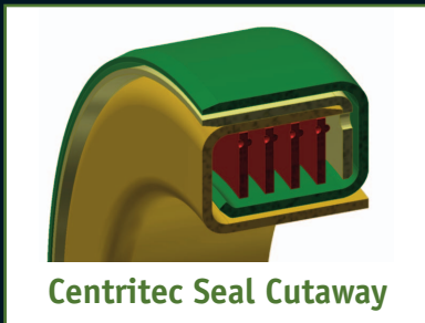
Centritec Seal Cutaway